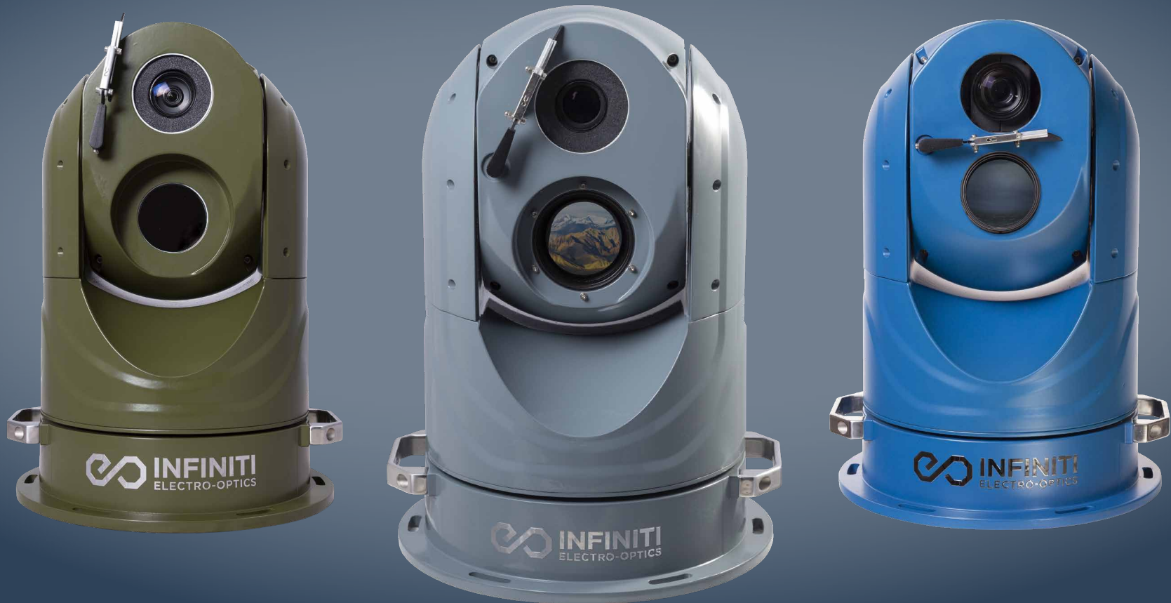
Examples of Neptune orders with custom RAL paint color and optional wiper (both must be specified at time of order).