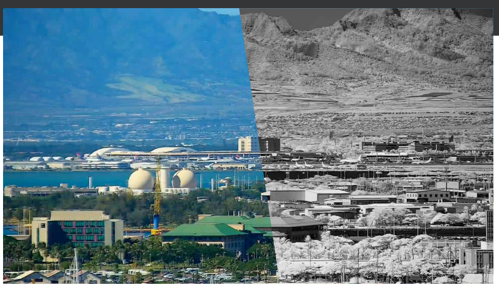
Standard Color Visible Image (Optical Fog Filter Disabled)

The Atlas's precision engineered IR-corrected zoom lenses are built with high quality optical glass and feature integrated rapid auto focus. We offer a wide range of focal lengths with zoom factors from 3X up to 30X optical zoom. At full zoom, our longest range 30X lens option has the equivalent field of view of a "full-frame" DSLR camera with a 950mm lens.